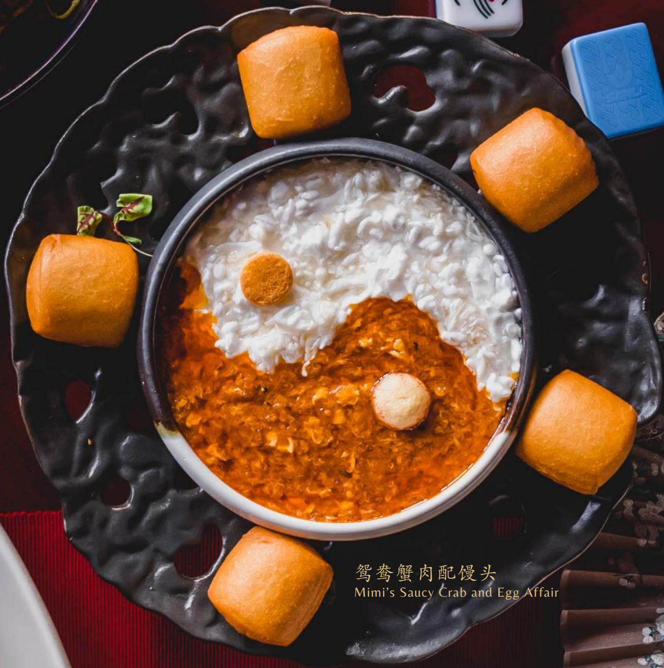
鸳鸯蟹肉配馒头 Mimi's Saucy Crab and Egg Affair