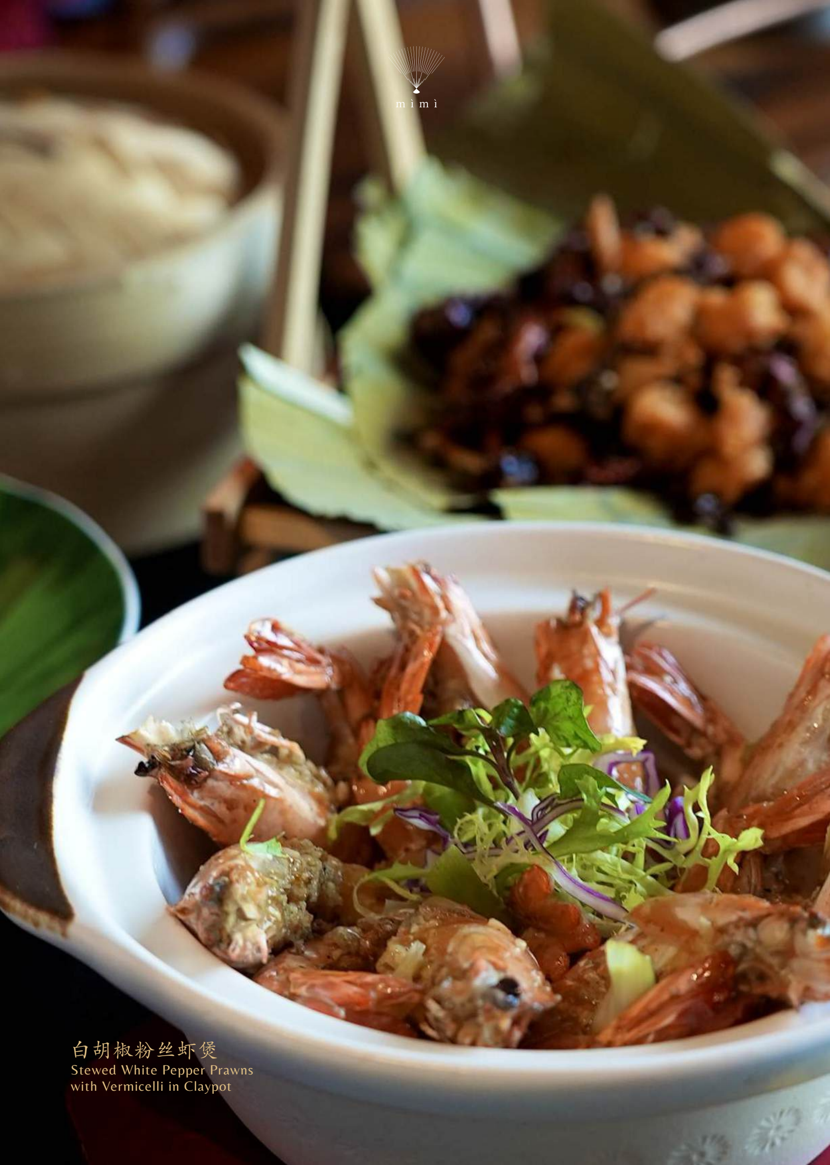
白胡椒粉丝虾煲 Stewed White Pepper Prawns with Vermicelli in Claypot