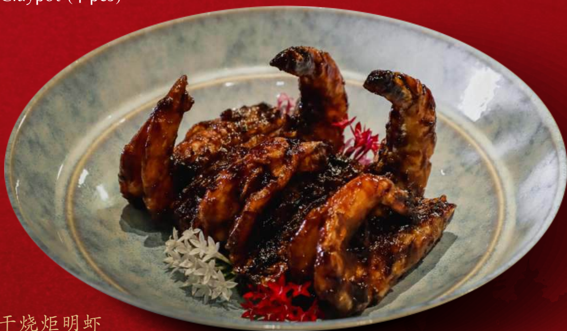
干燒炬明蝦 Baked Prawns in Chef's Special Sauce

多寶魚 (至少2片) (娘惹蒸/金銀蒜/港式蒸) | 16/pcs Turbot Fish (Min. 2 pcs)