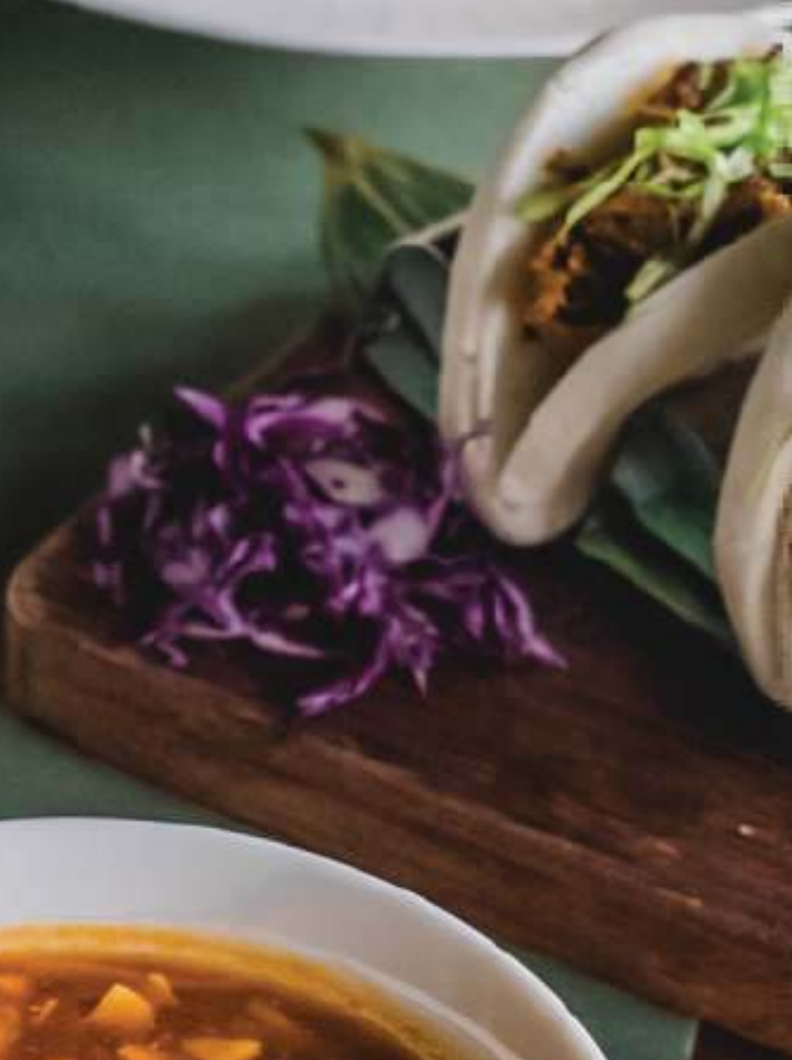
酸辣汤 (素) Sze Chuan Hot & Sour Soup