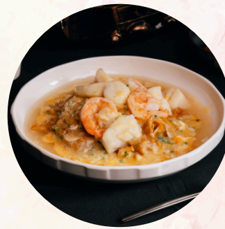
SILKY EGG SEAFOOD HORFUN