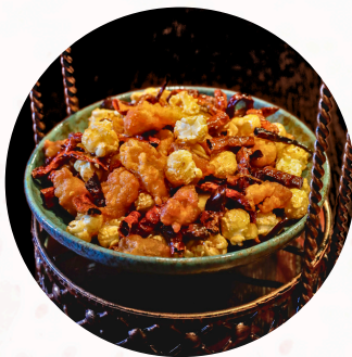
FIRECRACKER CHICKEN WITH POPCORN TOSSED IN MIXED SPICE