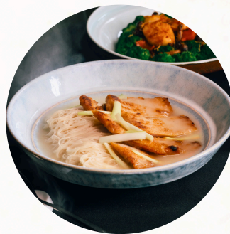
PORK CHOP VERMICELLI