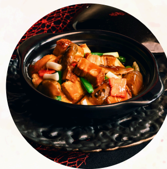
BRAISED BEANCURD IN CLAYPOT