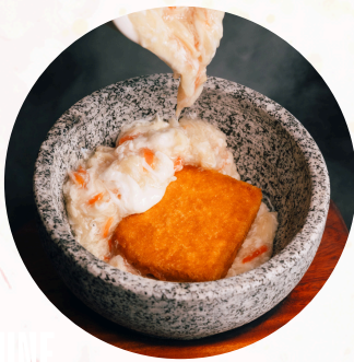
HOMEMADE BEANCURD WITH CRAB MEAT