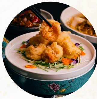
CRISPY KING PRAWN BALLS